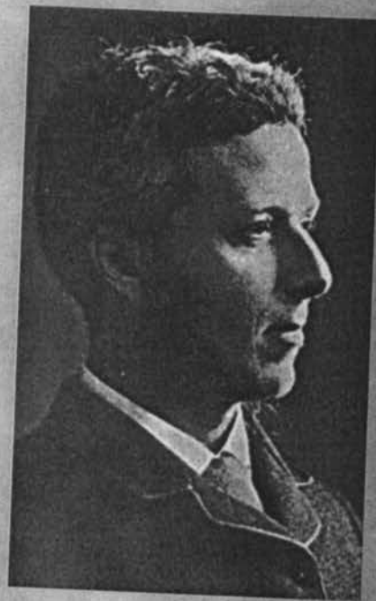
Joseph Bell was noted for his deductive reasoning applied to clinical problems. He hired medical student Arthur Conan Doyle as his assistant in 1878.

The stint as Bell's assistant stimulated far more than Doyle's interest in medicine. He would find in